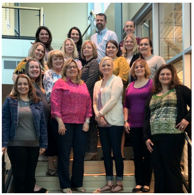
Reynolds Memorial, Broaddus Hospital, Thomas Health, Grant Memorial, Jackson General, Logan Regional, Stonewall Jackson Hospital, Roane General, Potomac Valley Hospital, Preston Memorial, Cabel Hospital, participating partners with WVHA.

WVHA hopes to work with OpusWorks again in the future to expand the reach of training to more front-line hospital employees. The future plans are contingent upon being awarded the HIIN contract in 2019.